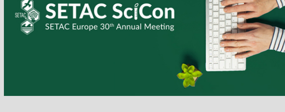
SETAC SciCon • May 2020