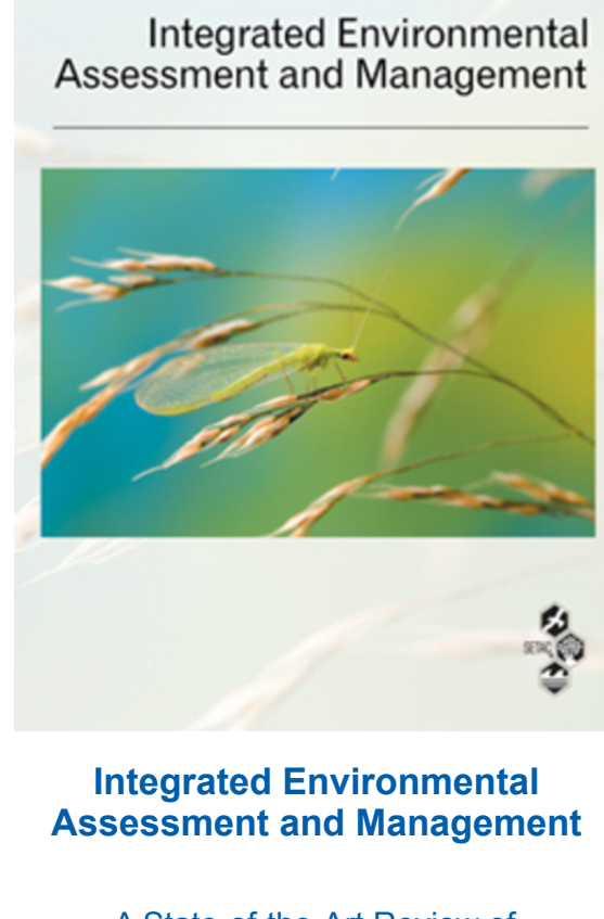
Integrated Environmental Assessment and Management